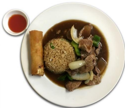
PEPPER STEAK / FRIED RICE / EGG ROLL