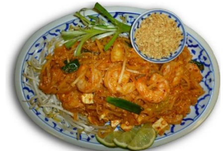
Phad Thai Shrimp